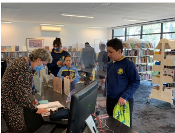
Students enjoying library time