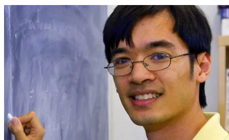
Terry Tao (b1975)

An Australian of Chinese heritage who lives in the US, Tao won (and accepted) the Fields Medal in 2006. Together with Ben Green, he proved an amazing result about prime numbers - that you can find sequences of primes of any length in which every number in the sequence is a fixed distance apart. For example, the sequence 3, 7, 11 has three prime spaced 4 apart. The sequence 11, 17, 23, 29 has four primes that are 6 apart.