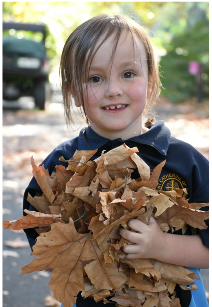
Stay Tuned For The Grade 1 Excursion Feature In Next Week's Newsletter